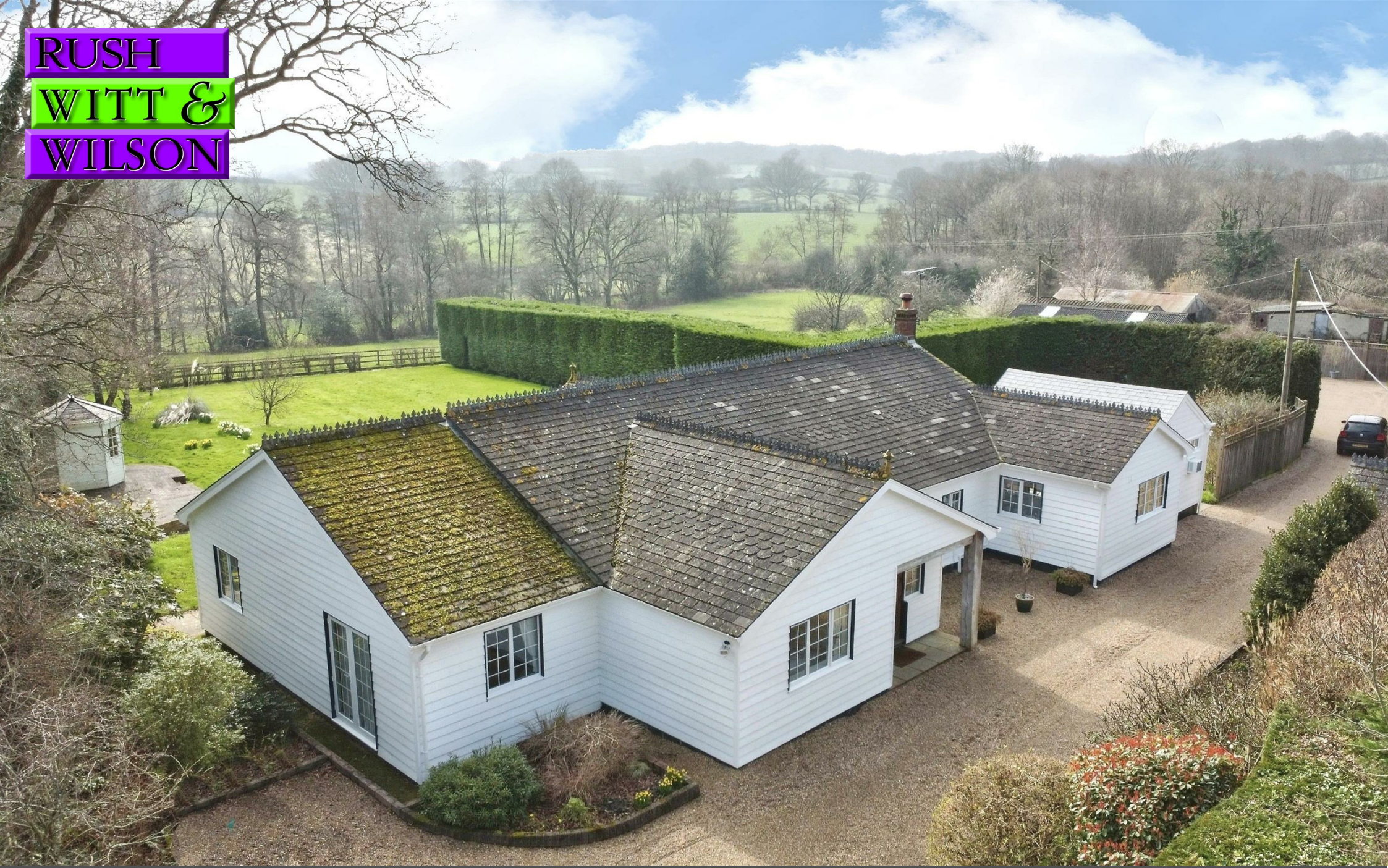
Cappella, Watermill Lane, Beckley, East Sussex, TN31 6SH. £1,050,000 Freehold